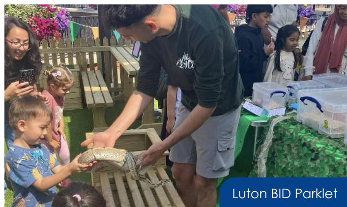
Luton BID Parklet