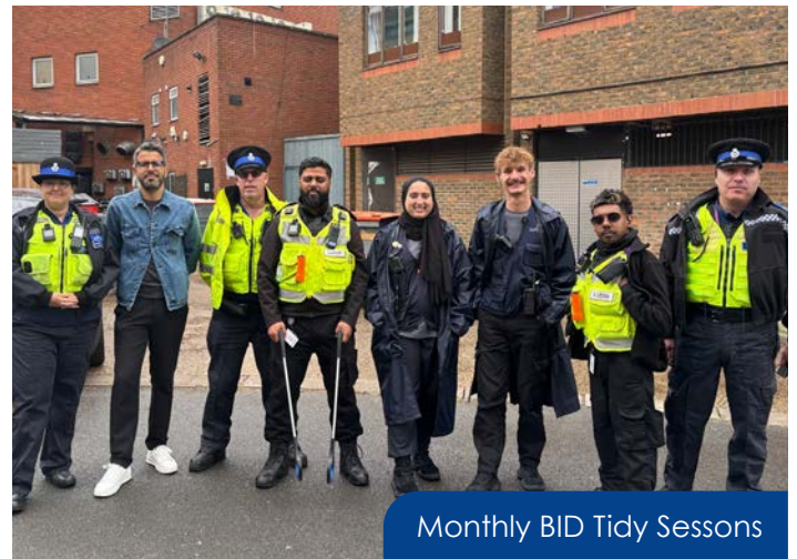
Monthly BID Tidy Sessions