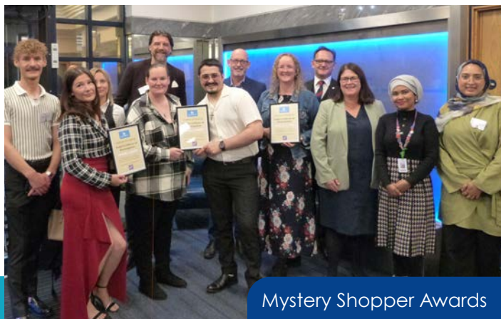
Mystery Shopper Awards

The Mystery Shopper awards took place on Wednesday 17th September, a special ceremony where businesses were celebrated and received recognition. The primary benefit of the scheme is the provision of detailed, constructive feedback, enabling businesses to identify specific areas for improvement, ultimately leading to higher customer satisfaction, increased loyalty, and a more competitive and appealing retail environment across the BID area.