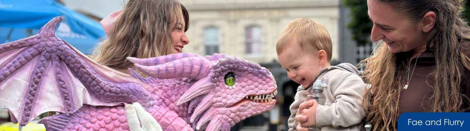
Fae and Flurry