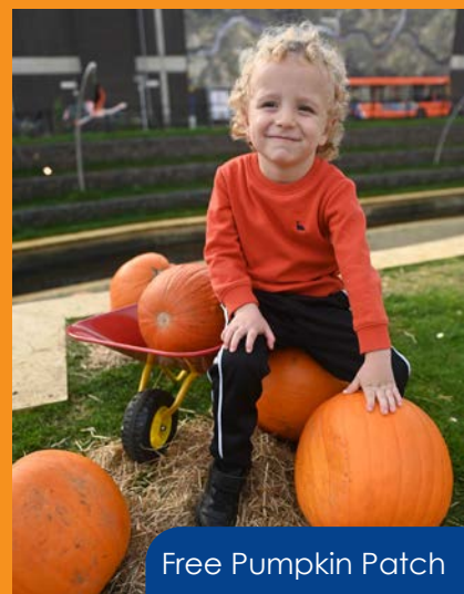
Free Pumpkin Patch