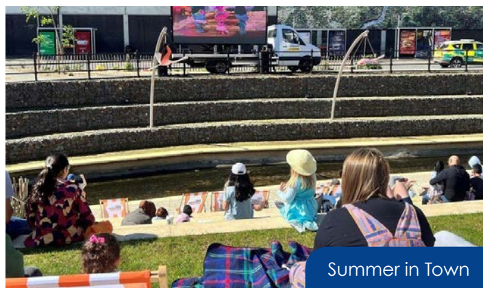
Summer in Town

By offering structured, entertaining activities in public